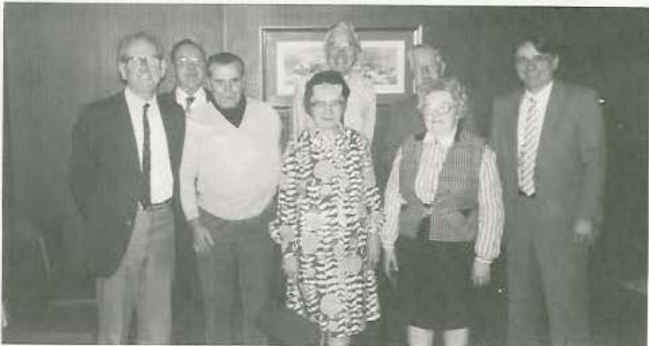
Region 1's Lunch in Dundee.