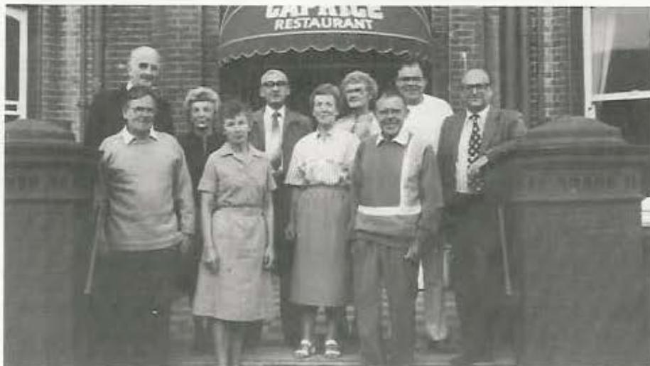
Course 3 '86.

Those who were unfortunate enough to retire before the advent of our pre-retirement courses may well be curious about the subjects covered on these courses. You need wonder no longer, all will now be revealed! Reproduced below is a replica of our course timetable and, no, I am sorry, you cannot attend it if you have already retired!