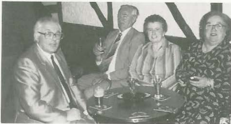
At The Dawnay Arms October '86