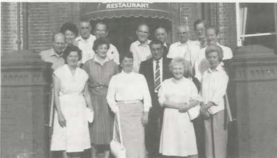
Course 1 '87.