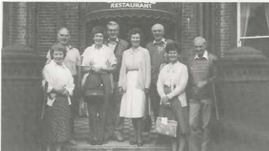
Course 4 '86.