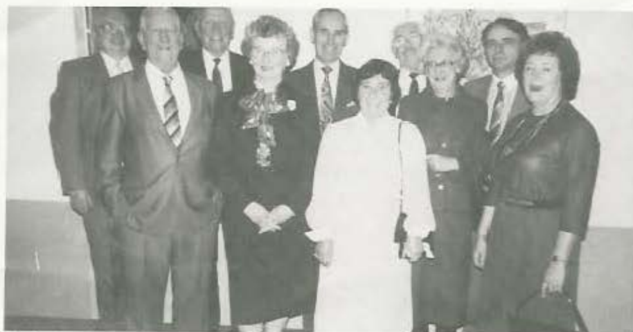
Region 1's Lunch in Glasgow