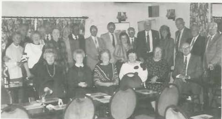
The Region 2 East Lunch.