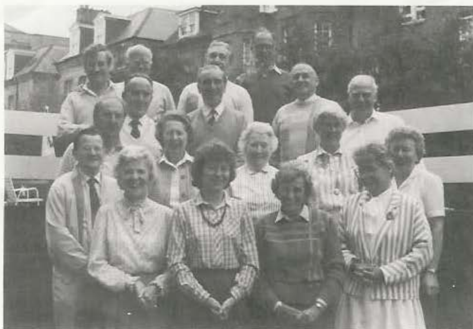
Course 2 '87.