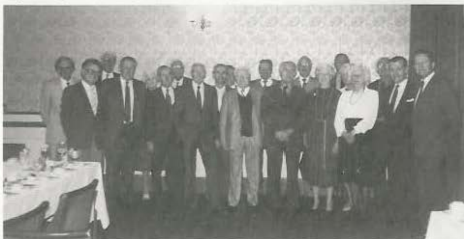
Region 2 West at the Lymm Hotel.