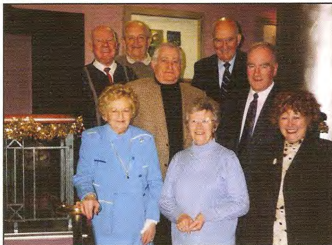
Region 10N Christmas 2003