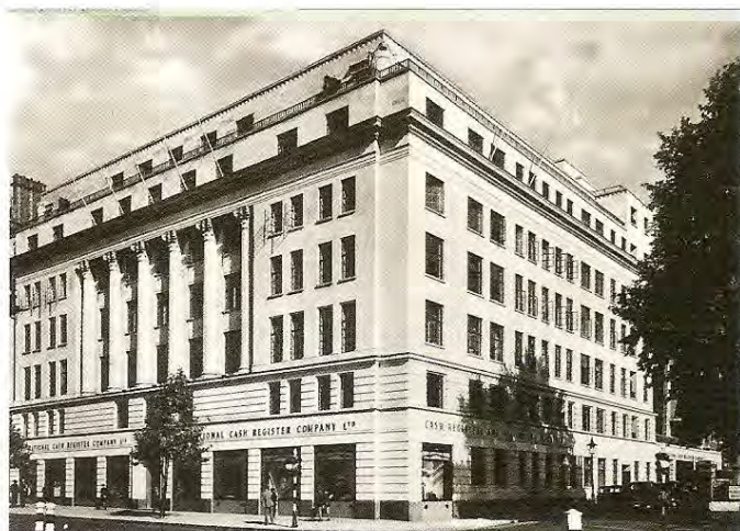
Marylebone in Happier Days