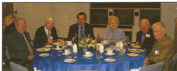
Region 8 Lunch .