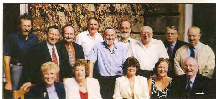
Edinburgh Lunch 3 rd . September 2003