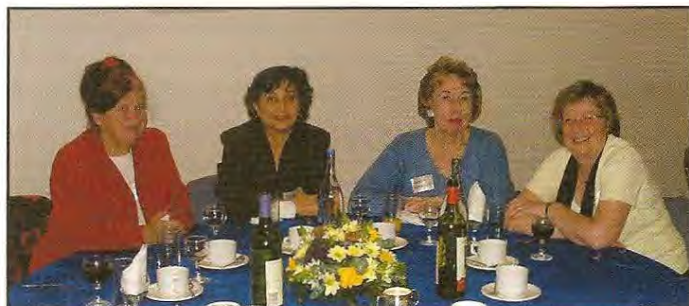
Region 8 Lunch