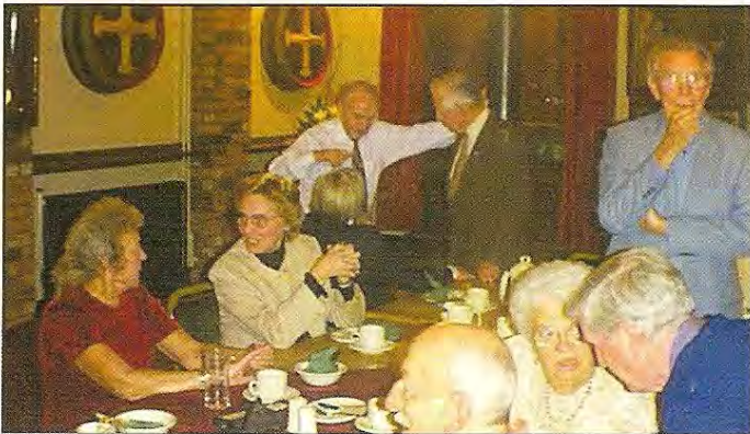
Animated Groups enjoying themselves at the Region 3 Lunch at the Bass Brewery Museum