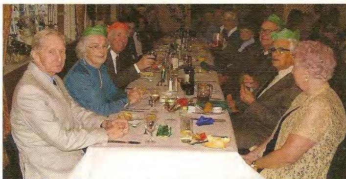
More guests at the Great Western Christmas lunch