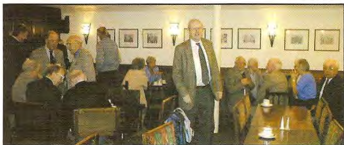
Official Lunch at the Wheatsheaf