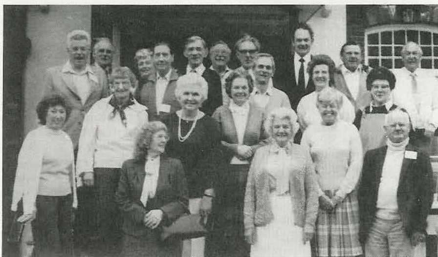
HALF WAY THROUGH OUR RETIREMENT COURSE AND WE ARE STILL ENJOYING IT!